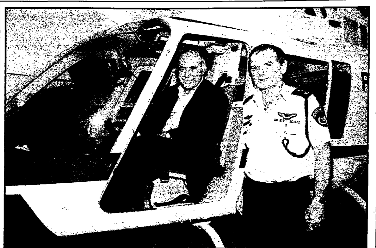
Cop 'copters: Internal Security Minister Avigdor Kahalani takes a seat in a police helicopter accompanied by police helicopter unit commander, Dep.-Com. Ya'acov Biran, during a visit with the unit in Latrun earlier this week.

Winning cards: The winning cards in Tuesday's Mifal Hapayis Chance draw No. 159/97 were the 10 of spades, jack of hearts, king of diamonds and nine of clubs.